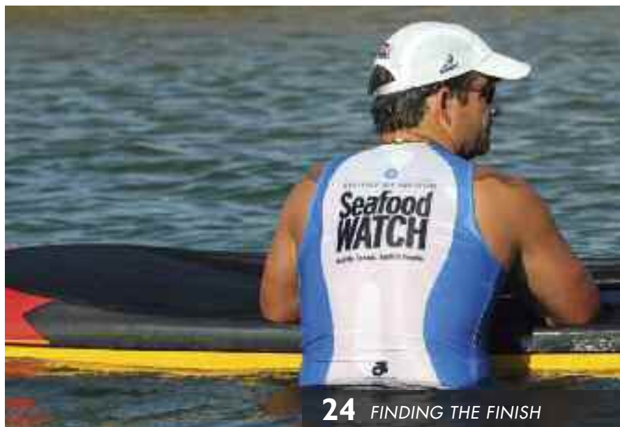
24 FINDING THE FINISH

Ready to feel more with less? Experience four new PureProject™ shoes by Brooks on October 1 at your local running shop. Or, visit brooksrunning.com/pureproject .