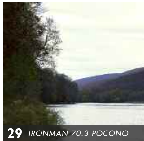
29 IRONMAN 70.3 POCONO