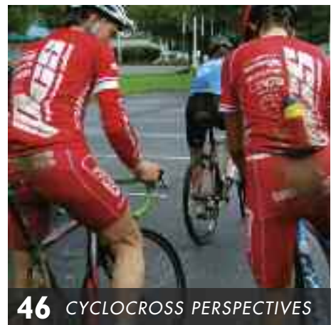
46 CYCLOCROSS PERSPECTIVES